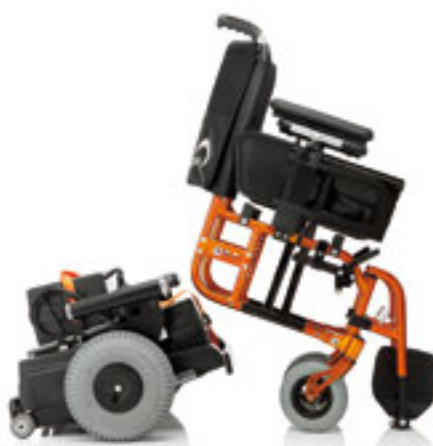
Drive kit assembly.