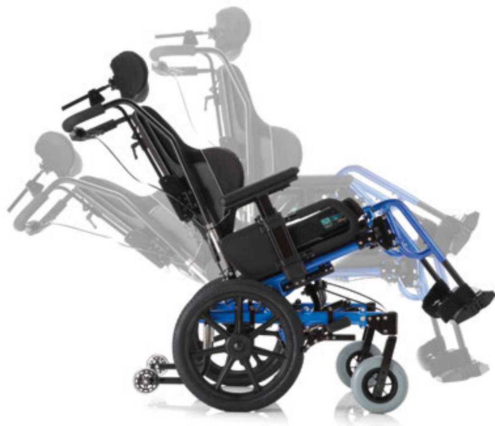
Tilt-in-space from 0° to 40°.