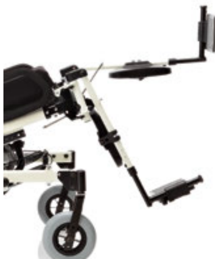
Version with swing away and removable elevating footplates.