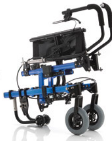
Maximum reduction of encumbrance, easy to load it even into an utility car.