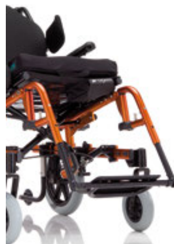
One piece footplate and front frame angle adjustment (optional).