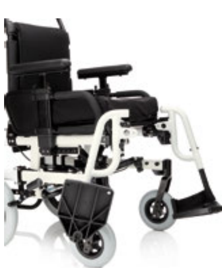
Removable and swing away (outwardly) split footplate (standard).