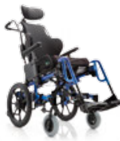
TEKNA TILT ADULT