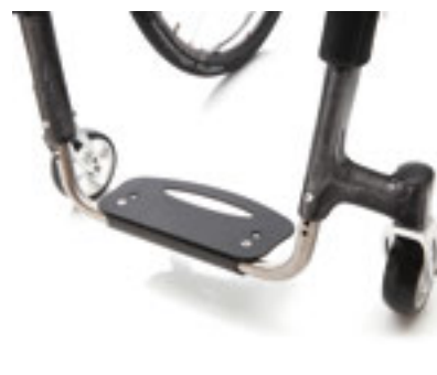
Frame with adjustable footplate (optional).