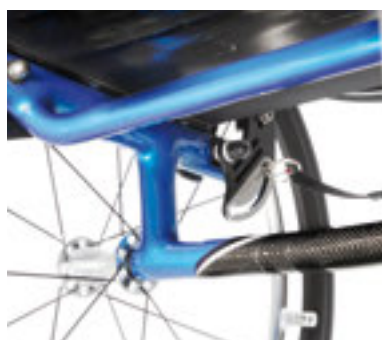
Monocoque carbon fibre frame, made-to-measure.