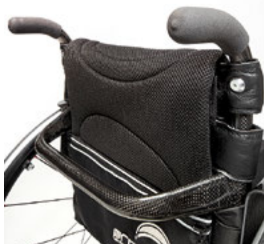
Height and angle adjustable carbon fibre backrest with light upholstery.