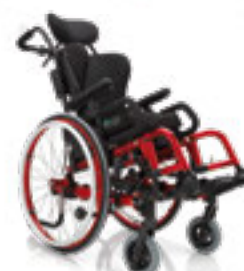
TEKNA TILT JUNIOR