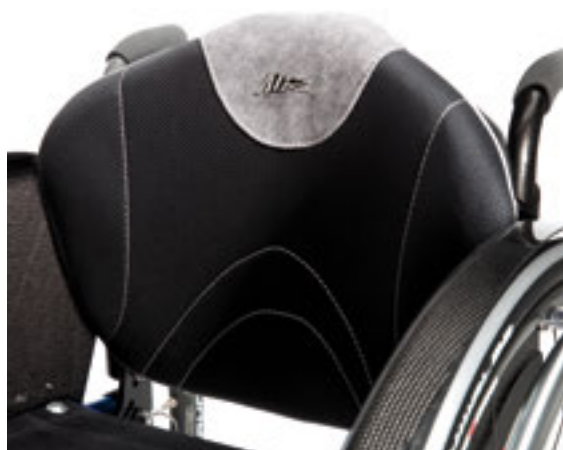
New carbon fibre AIR backrest (optional), exclusive for the line of Progeo's rigid wheelchairs. It approximately keeps the weight characteristics of the version with upholstery and it allows all adjustments for a optimal posture.