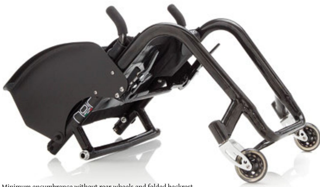
Minimum encumbrance without rear wheels and folded backrest.