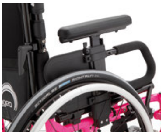
Version with removable and height adjustable Desk armrests (free option).