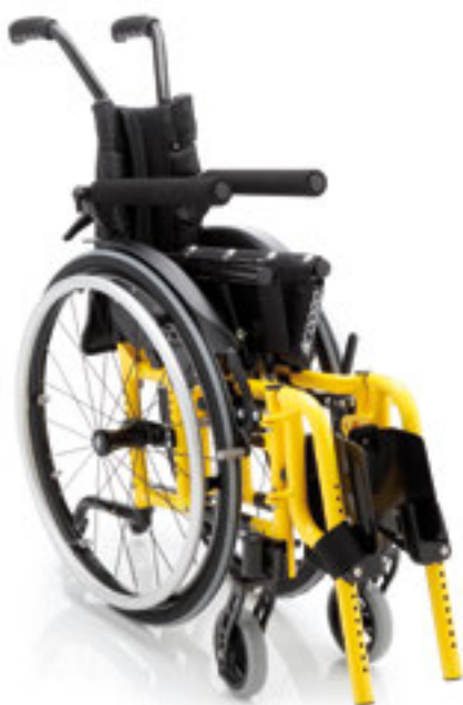
Extremely compact when folded.