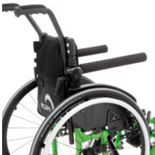
Version with mudguards (standard), removable and height adjustable push handles for attendant (standard) and flip-up and height adjustable tubular armrests (optional).