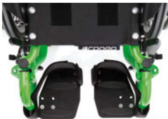
Angle and depth adjustable split footplate with heel strap.