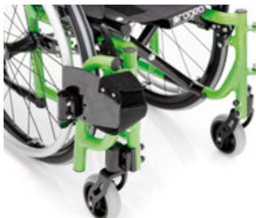
Removable, swing-away footplate.