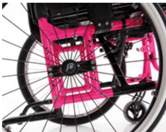
Rear wheel height and setting adjustment, anti tip system (standard).