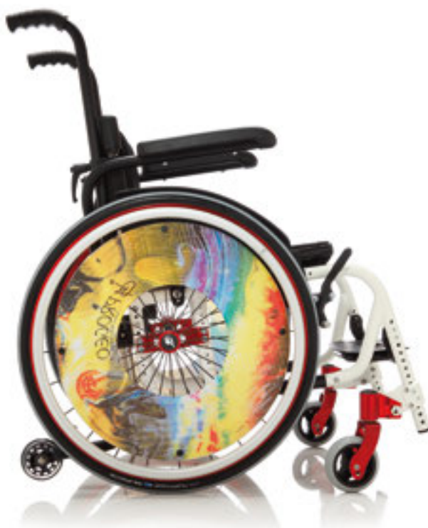
Standard frame version with length and seat depth adjustment plus some optional.