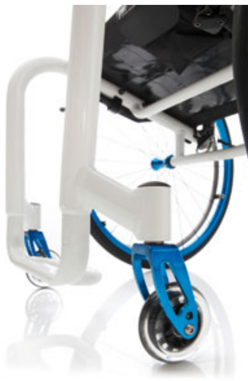
Fully welded frame, made-to-measure.