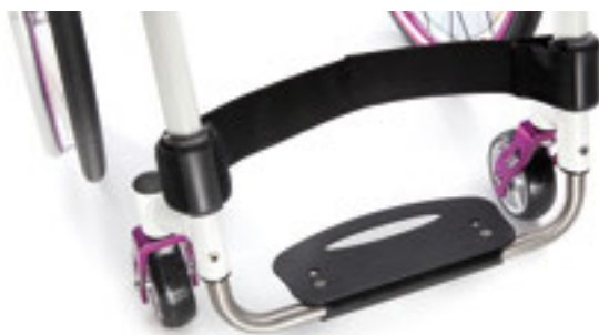
Frame with adjustable footplate (optional).