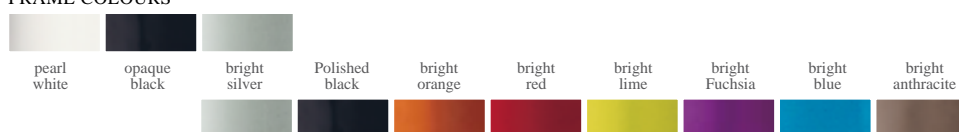
SET COLOURS (REAR WHEELS AND FORKS)

TPOLOGY: Ultra light wheelchair with rigid frame for indoor and outdoor use. Product's technical data – see page 48