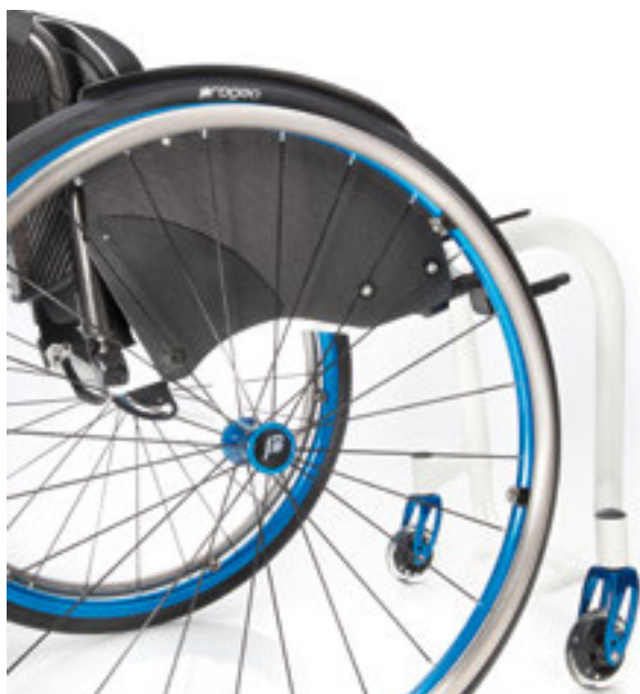
Carbon fibre mudguard.