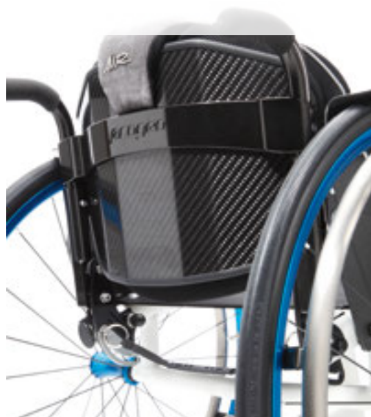
New carbon fibre AIR backrest (optional), exclusive for the line of Progeo's rigid wheelchairs. It approximately keeps the weight characteristics of the version with upholstery and it allows all adjustments for a optimal posture.