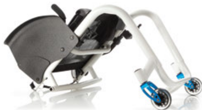
Minimum encumbrance without rear wheels and folded backrest.