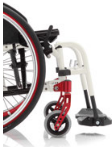
3 frame angles for the removable footplates: 95°