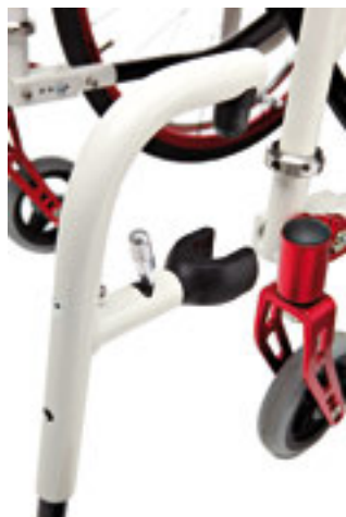
Easy-to-operate footplate lock lever.