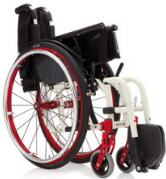
Extremely compact when folded.