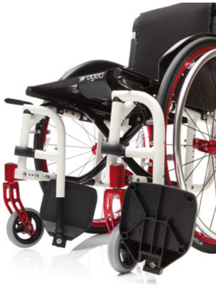
Removable and swing-away (inwardly/outwardly) footplates.