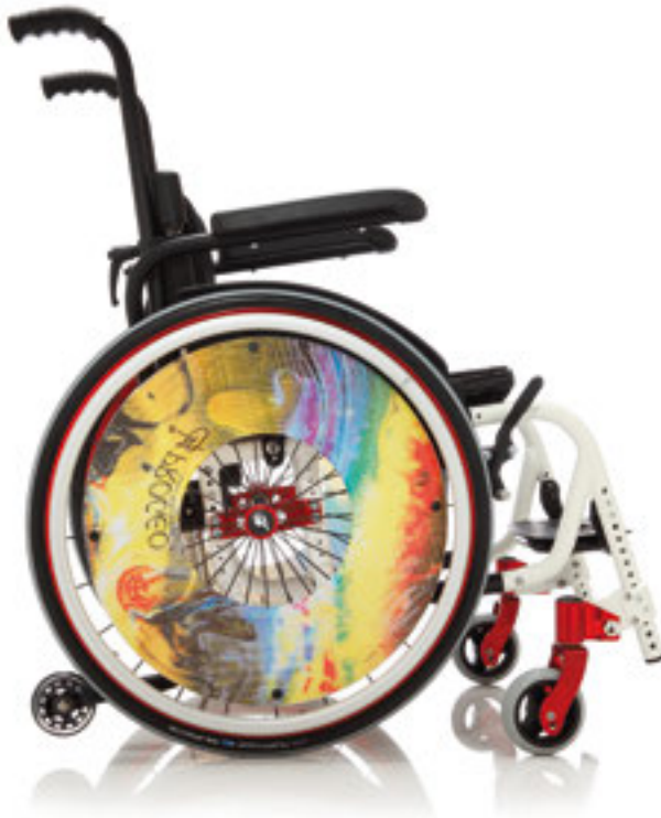
Standard frame version with length and seat depth adjustment plus some optional.