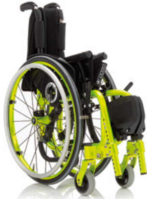
Extremely compact when folded.