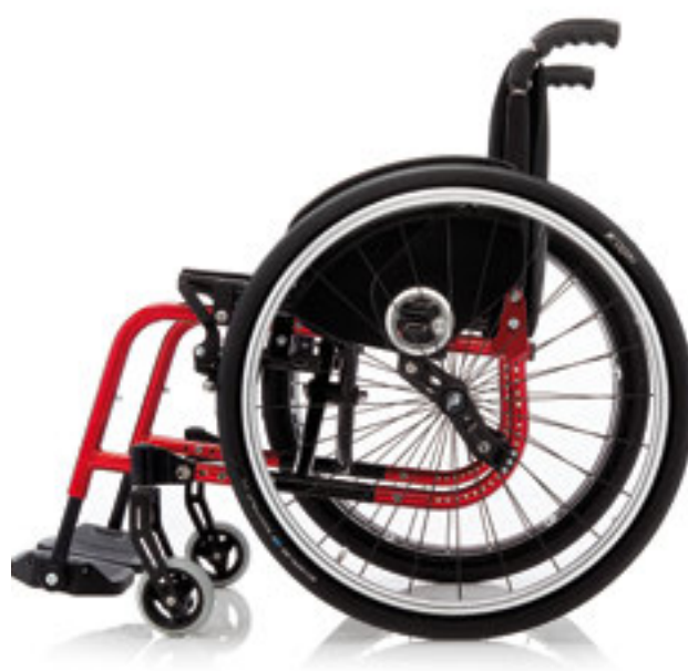
Dynamic rear frame version (optional) with multi-adjustment rear wheel jointed plate, backrest angle adjustment and mudguard with rotative adjustment system.