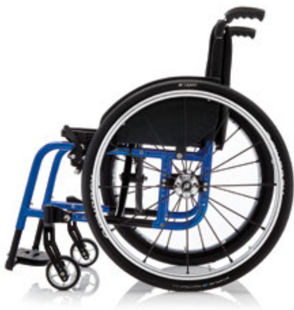
Standard frame version available with 2 front angles and 3 lengths.