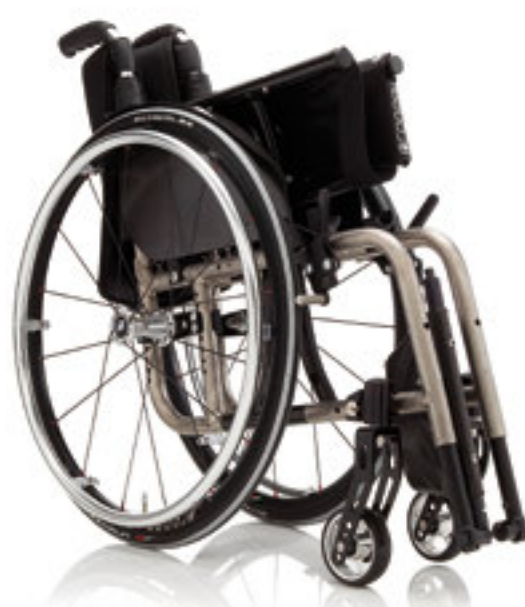
Extremely compact when folded.