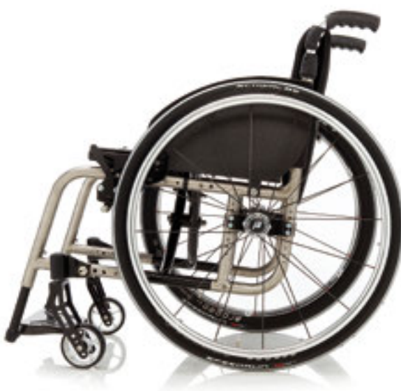
T-MAX brushed titanium frame version (optional). Maximum resistance and consistent weight reduction.