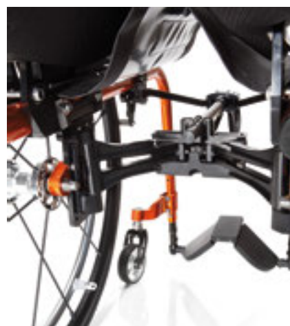
Syncro Motion Folding Axle, innovative Progeo concept.