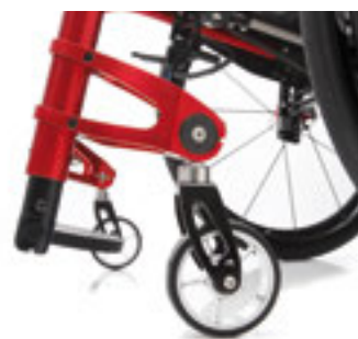
Sliding front height adjustment with new fork support (free option).