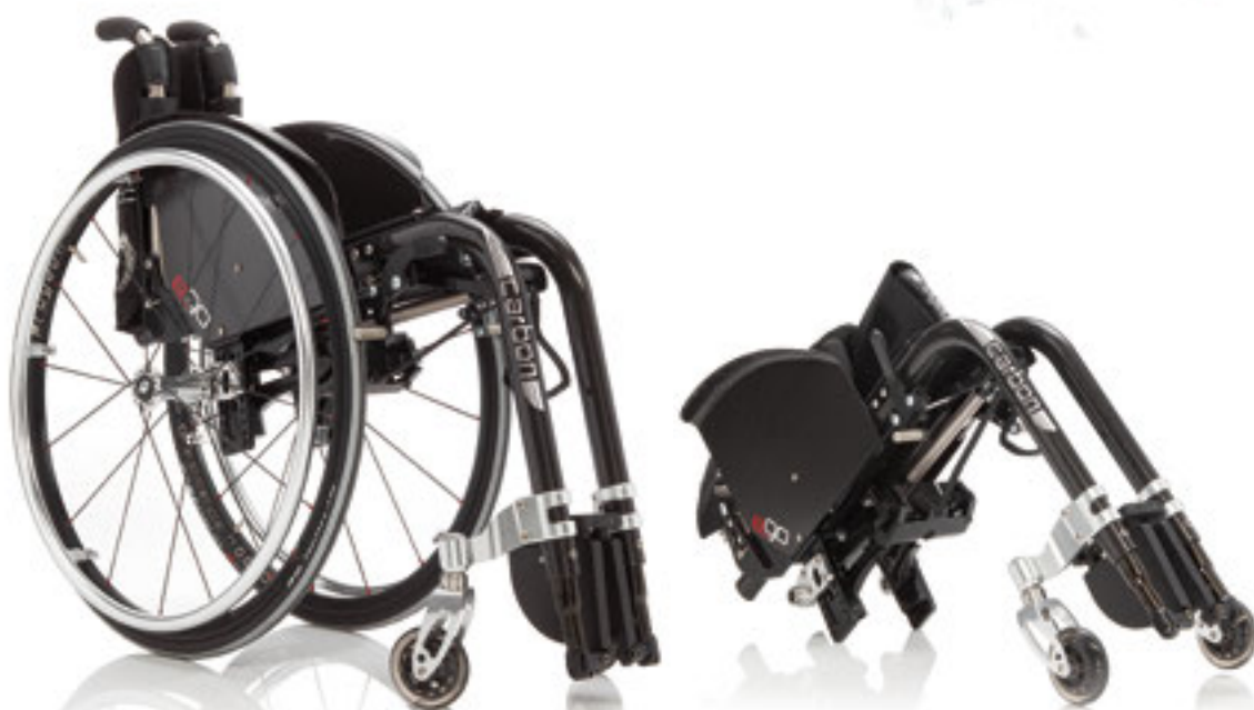
Extremely compact frame and minimum encumbrance, easy to load it in a car.