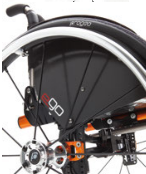
Wide range of adjustment: • rear height • backrest height • setting • backrest angle.