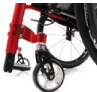
Sliding front height adjustment with fork with integrated spirit level (free option).