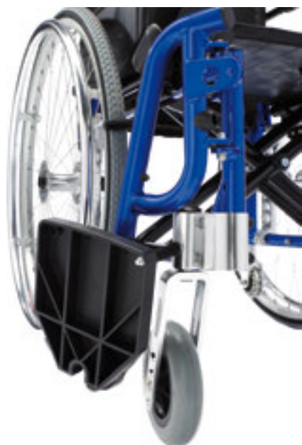
Swing away (outwardly) and removable footrests with easy-to-use system. Front height adjustment.