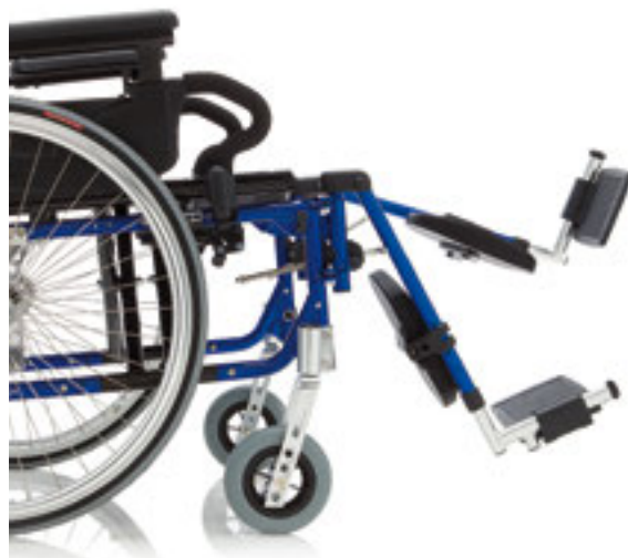
Plus configuration with elevating footrests (optional).