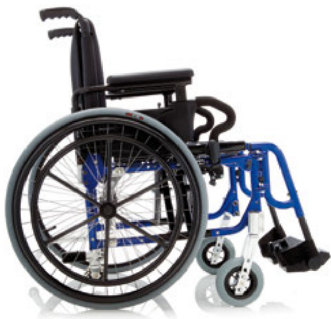
Plus configuration with one arm drive (optional).