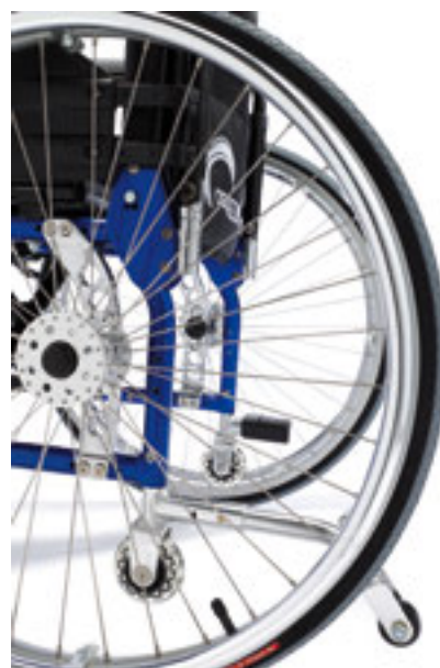
Wide range of adjustment: • backrest angle (+6°, 0°, -6°) • setting (also for amputees) • rear height (7 positions).