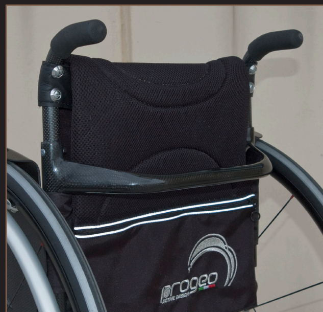
Carbon fibre backrest with ergonomic upholstery