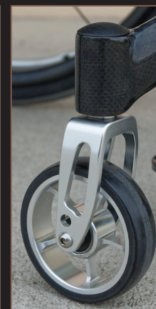
New sport fork, carbon support, titanium axle