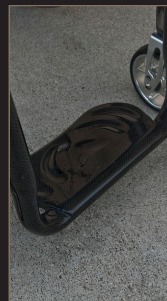
One piece carbon footplate ( not adjustable )