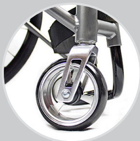
Welded castor housing with aluminium cap and welded castor fork