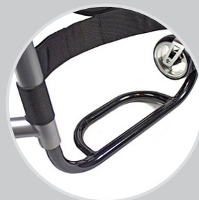
Height adjustable footrest and velcro calf strap