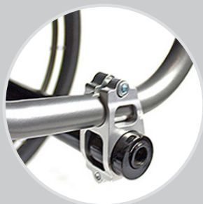
Adjustable centre of gravity (integrated available)